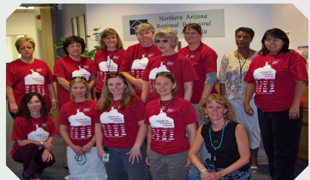
NARBHA raised over $1500 for the American Cancer Society's Climb for Cancer Walk - a 7-mile, 2000-foot elevation walk up Snowbowl Road in Flagstaff.